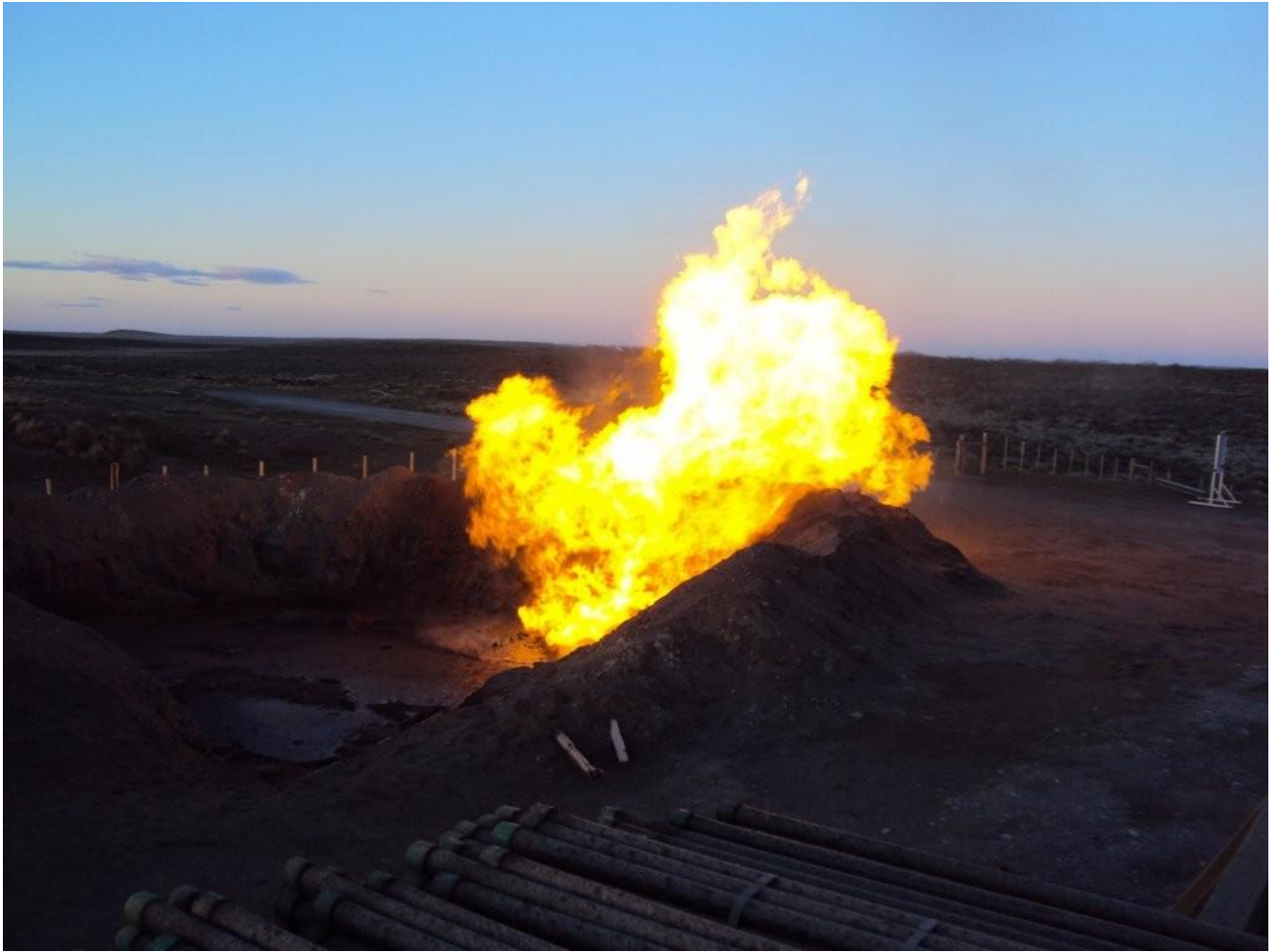
Rio Del Oro-1A testing